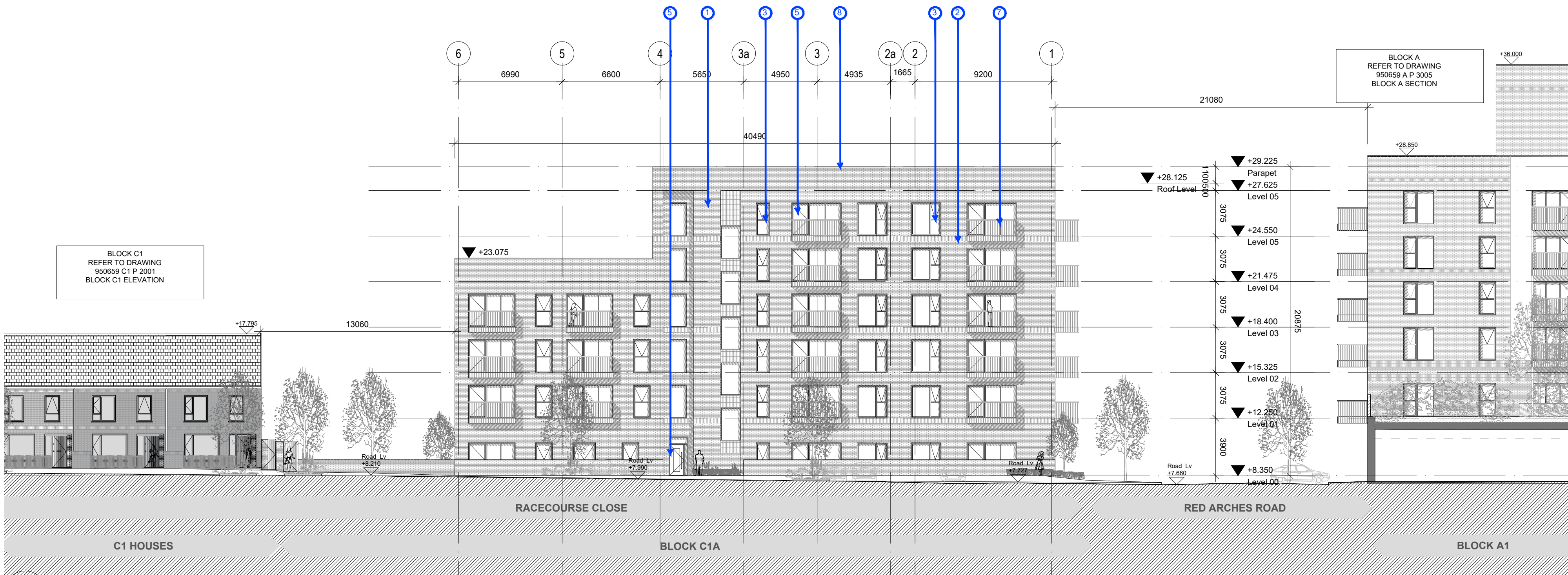
01 EAST ELEVATION BLOCK C1A P2001 SCALE: 1:200